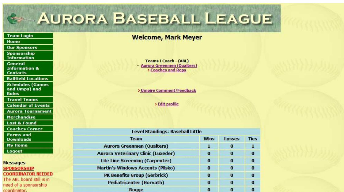
Pic 1: Team Home Page